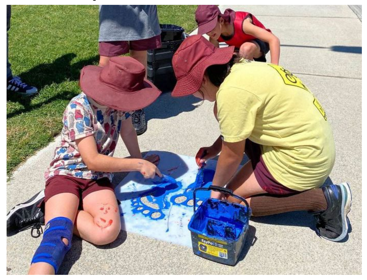
Students participating in the safe routes stencil painting activity.

• Footprints encourage people to walk on left side and to share the path with other users. Stop signs are for road crossings.