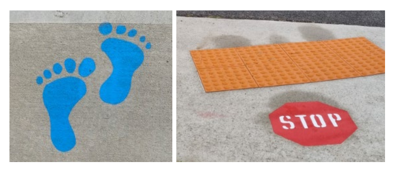
Examples of safe routes to school stencil markings.

Teachers can modify and extend ideas for different year levels and phases of schooling. Teaching ideas have been aligned to the Western Australian Curriculum, including identification of learning area, strand and sub-strand.