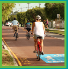
Safe Active Street