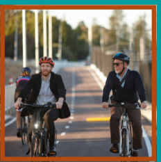
Principal Shared Path