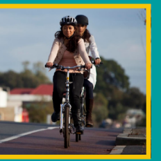
Bicycle Lane or Sealed Shoulder