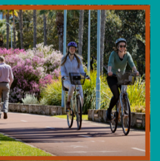
High Quality Shared Path