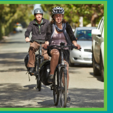
Bike Friendly Route