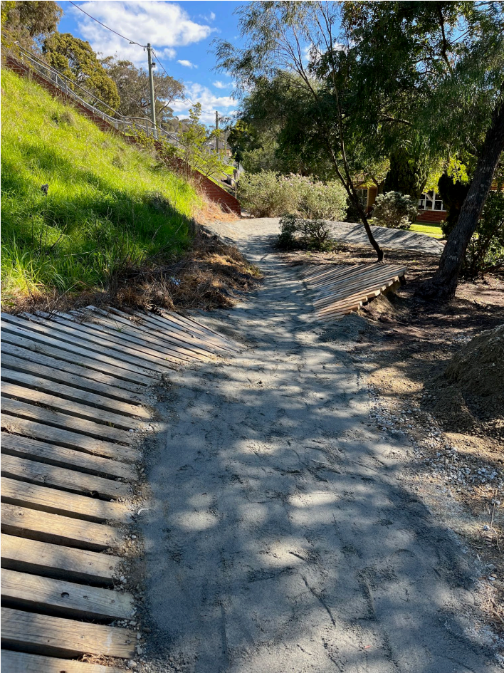
Figure 6 Albany Primary School 2023 CSG funded upgrade