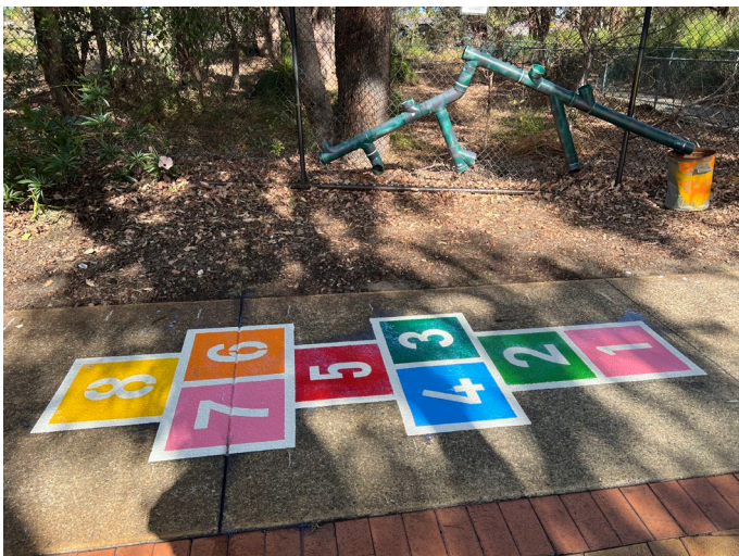
Figure 7 Noranda Primary School Bushland Pathway activation

Since the implementation of the project, the school has already observed a significant increase in the use of the bushland pathway by students and community members. The pathway transformation aides in promoting active travel, highlighting the safest entry point for walkers and wheelers, and improves the overall wellbeing of the students.