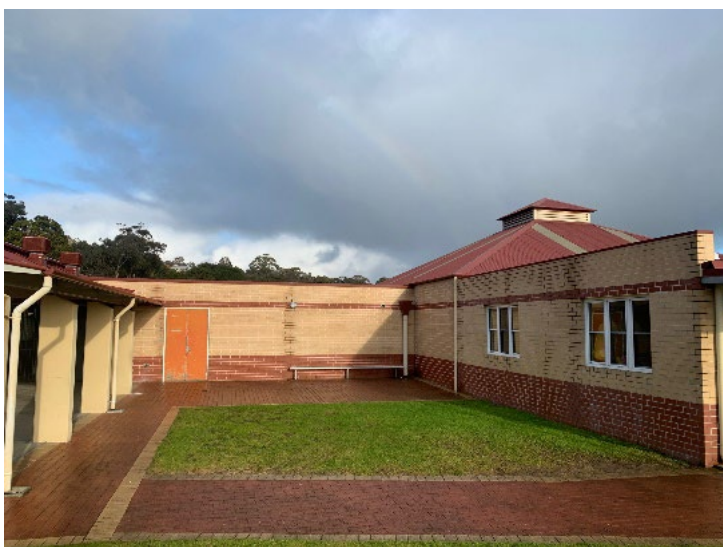
Figure 2 Proposed bike shelter location

Stage 3 (if required): Extend paving and construct second covered bike shelter.