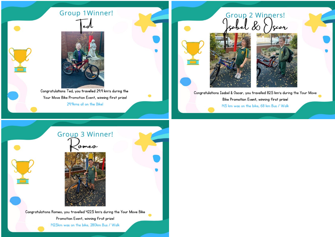
Figure 1 Certificates given to winning St Patrick's students