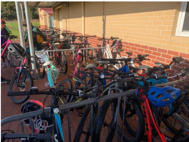
Figure 4: Existing bike racks